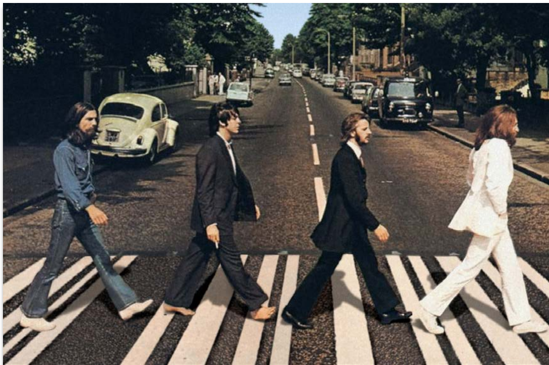
8 August 1969, Abbey Road London